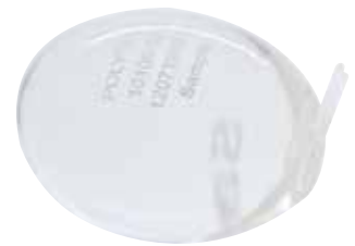
With needle guide

Implants made by POLYTECH – Quality made in Germany