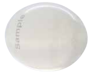
With reinforced cap

Filled with silicone gel or soft silicone elastomer, with reinforced cap or needle guide, each type available in five sizes